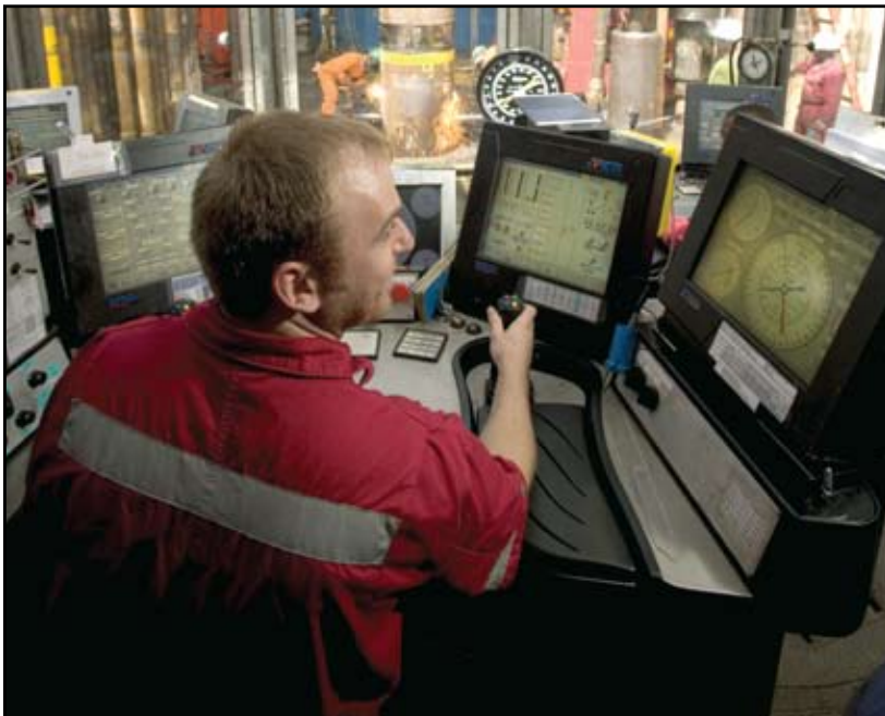
Deepwater drilling calls for specially trained workers at the controls.

Cost is 2650€ per person. Space will be limited. Date to be determined; check our Web site for updated information.