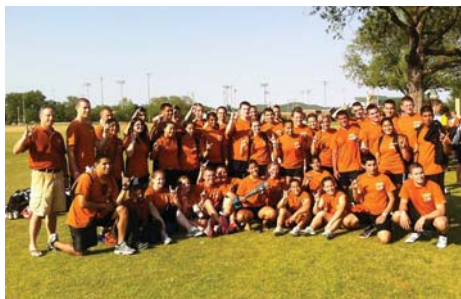
Field Day 2011

Waking up at 0500 to drive multiple hours is never fun, unless you're in the company of the Longhorn Airmen! We started bright and early meeting in the C Lot on campus at 0545 to group up before we left for Baylor. We headed in caravans of about 2 cars to make sure we got to Waco safely, and on time. My caravan stopped in North Austin for tacos, which was, to me, the best decision of the day. We arrived at Baylor and checked in, with our leader C/Col Stout rallying us all together for shirt pass-out. Just like the previous year at TCU, Baylor had printed shirts with different colors, respective to each school. As we donned our new burnt orange shirts we prepared to engage in the days activities. The first events were Ultimate Frisbee and Basketball. We took 3rd in Ultimate overall. The highlight of the day was Dodgeball, where we mercilessly advanced through each round up to the final versus Baylor. We lost the first of three games, but then went on to win the second and third, thus taking the title of Texas AFROTC dodgeball champions! The rest of the day we participated in events like track, weight lifting, and a pull-up competition. The final event of the day was soccer, in which we advanced all the way to the finals (again versus Baylor) thanks to many goals from Cadets Deitschel, Lindner, Meyer, and Hinojosa. Unfortunately, we just couldn't take the heat in the last game, and lost by one goal.