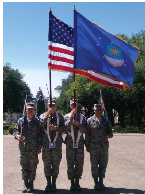
Parade practice on the Main Mall