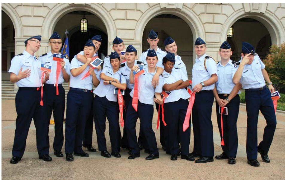
Cleared for Takeoff: Super Sabres and Warhawks at the base of the UT Tower