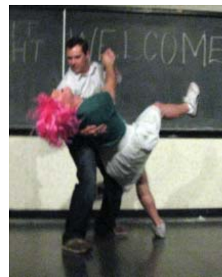
Just how far would you trust a guy in a skirt and pink wig? The author takes a dip at Skit Night

On a personal level, I feel that I am a much stronger and knowledgeable cadet. I feel that Arnold Air Society has helped me, and all of my flight mates to become more competitive for field training slots by giving us a head start on the knowledge required to succeed at Detachment 825 and within the Air Force as a whole. The Archangels and I are ready to graduate and push our training to the next