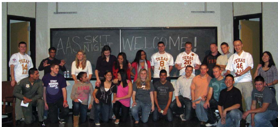
The Archangels and AAS actives present Skit Night