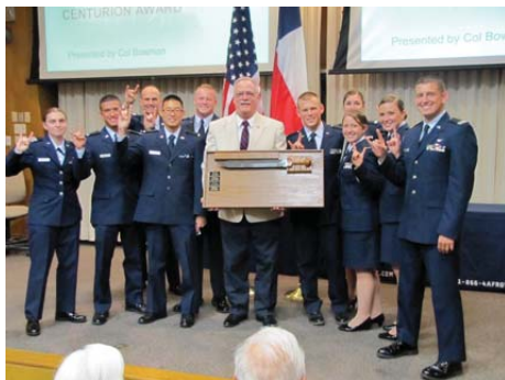
AS300s Rule...Again. AS300 class earns Longhorn Airman Centurion Award for the third consecutive semester