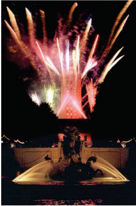
The Littlefield Fountain and the University of Texas Tower lit up to celebrate graduation