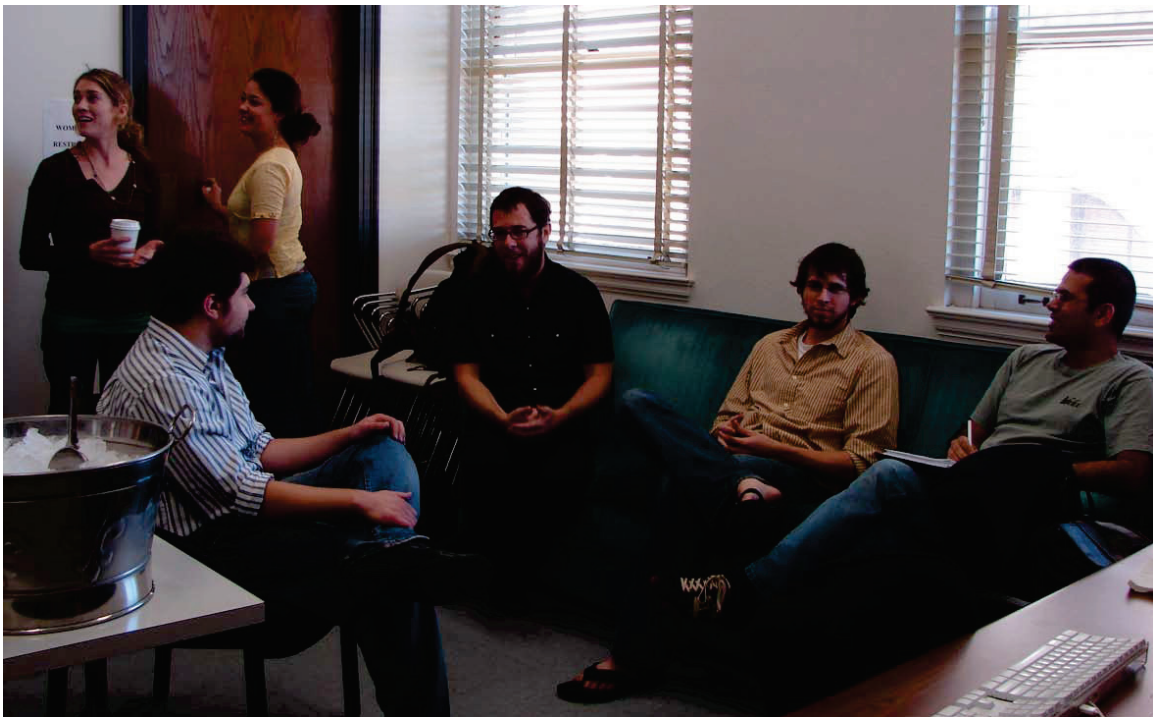
Graduate students hanging out in the departmental kitchen.