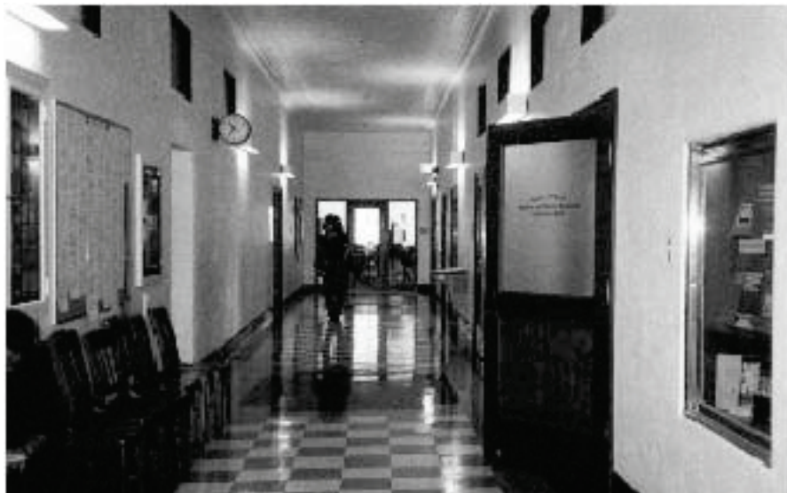
Hallway leading to Asian Studies faculty and staff offices

Thank you for your interest in the Asian Studies Graduate Program at The University of Texas at Austin. The University of Texas at Austin is among the nation's top fifteen research universities and is generally considered one of the five best public universities in the country. It offers many resources for interested students, including one of the country's largest research libraries. The University's graduate programs in Anthropology, Business, Classics, Geography, Linguistics, and Sociology are regularly ranked among the fifteen best in the United States. Almost all University programs are ranked in the top twenty-five nationally.