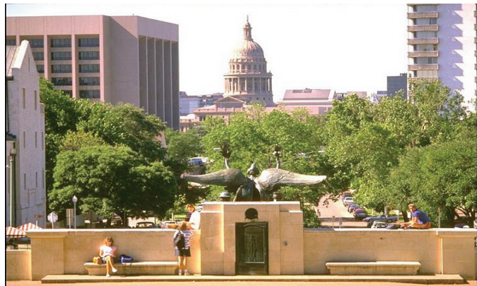
The Texas state Capital photographed from the Littlefield Fountain

Friendly and laid-back, yet bustling with energy, Austin offers a rich and eclectic range of diversions. Located on the eastern edge of the Texas Hill Country, Austin enjoys many of the area's best natural qualities. A short drive will take you to lakes, rivers, and spring-fed pools; hiking, climbing, biking and walking excursions amidst the beautiful Texas limestone; historic sites; and rolling landscapes filled with unique indigenous flora and fauna.