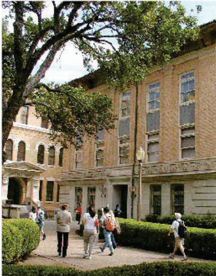
W.C. Hogg building, home to the Department of Asian Studies

M.A. and Ph.D. programs 2011-2013 Graduate Catalog