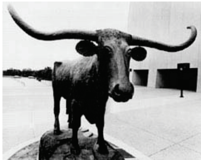
Statue of the University mascot, Bevo