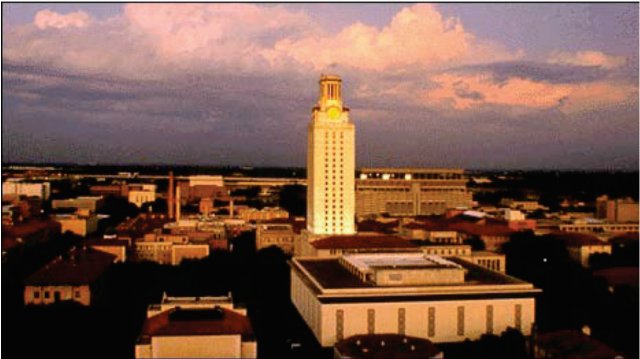
University of Texas Tower and campus (aerial view)