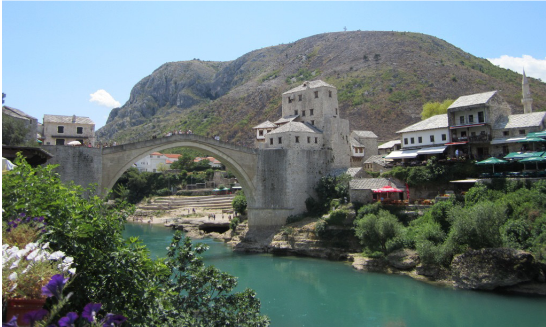
The Mostar Bridge, Bosnia-Herzegovina, destroyed during the Bosnian War and then rebuilt, divides the city of Mostar on Bosniak and Croat sides

What conclusions might we draw? Institutions matter, yet in new states, among newly empowered elites, they are avenues to obtain and maintain personal influence. They likewise can be altered to maintain that hegemony. Georgia has amended its constitution significantly at least twice since it was first ratified in 1995. Moldova has overhauled its constitution once; the proposed changes will enhance the power of the ruling coalition and be a death knell to the formerly dominant Party of Communists. But new constitutions also can freeze untenable political conditions. The constitution of Bosnia-Herzegovina was designed to end a war, not to run a state. The outcome is an impoverished polity that must maintain three separate administrations for each dominant ethnic group, isolates non-Slav ethnic minorities, and cannot even create a tax system without nationalist struggle. Small wonder that they cannot combat corruption. GGL