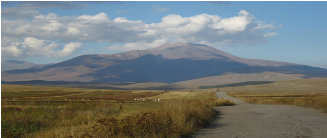
Near Lake Paravani, in Southern Georgia — the road is newly paved thanks to Millenium Challenge Funds

What conclusions might we draw? Institutions matter, yet in new states, among newly empowered elites, they are avenues to obtain and maintain personal influence. They likewise can be altered to maintain that hegemony. Georgia has amended its constitution significantly at least twice since it was first ratified in 1995. Moldova has overhauled its constitution once; the proposed changes will enhance the power of the ruling coalition and be a death knell to the formerly dominant Party of Communists. But new constitutions also can freeze untenable political conditions. The constitution of Bosnia-Herzegovina was designed to end a war, not to run a state. The outcome is an impoverished polity that must maintain three separate administrations for each dominant ethnic group, isolates non-Slav ethnic minorities, and cannot even create a tax system without nationalist struggle. Small wonder that they cannot combat corruption. GGL