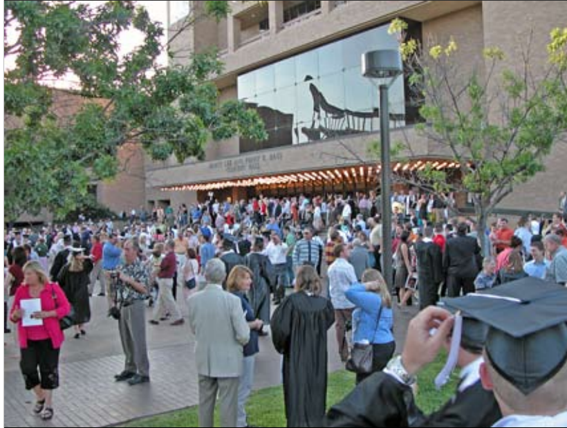
Department of History commencement is held in Bass Concert Hall