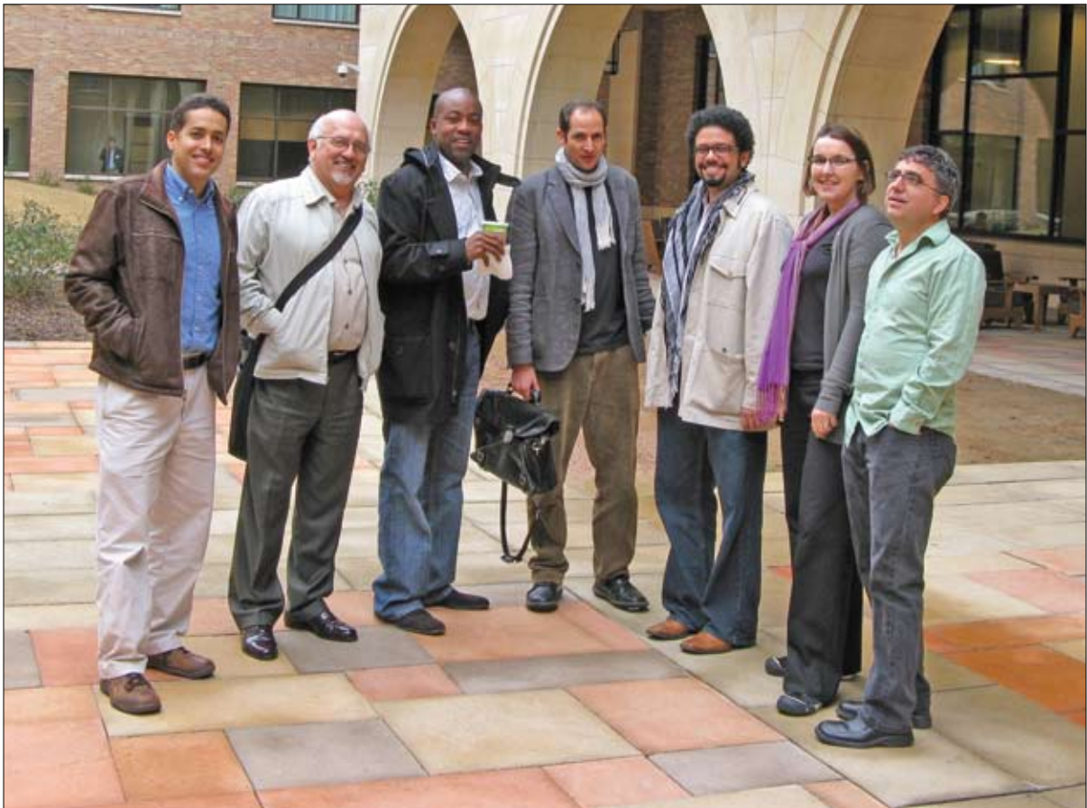
History faculty retreat at AT&T Conference Center

In contrast to other major cities, Austin is well known for its affordable living. There is no personal income tax in Texas. The state has one of the lowest tax burdens (45th) in the nation. The National Association of Realtors reports that the median