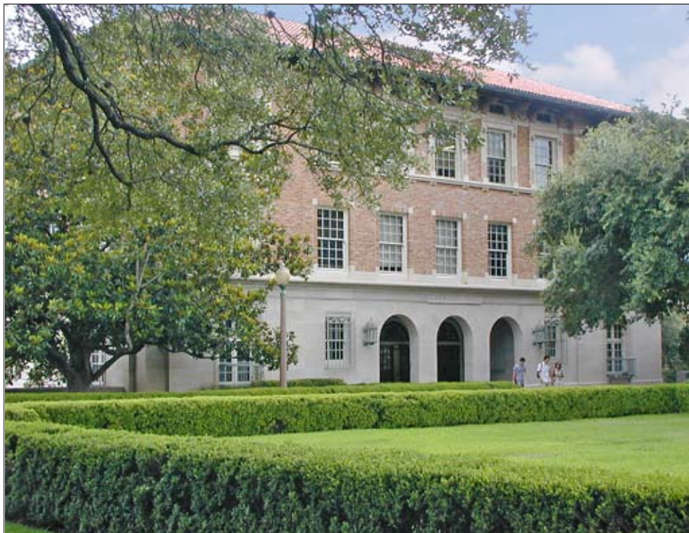
West entrance to Garrison Hall

T he historical resources at The University of Texas at Austin (UT) constitute one of the strongest and largest conglomerates in the nation. UT features an extraordinary constellation of professors and graduate students who are intensely dedicated but genuinely friendly. The Department of History emphasizes substance and meticulous scholarship. In contrast to artificial and outmoded divisions of history, our department highlights the intersections among diverse areas of the human experience.