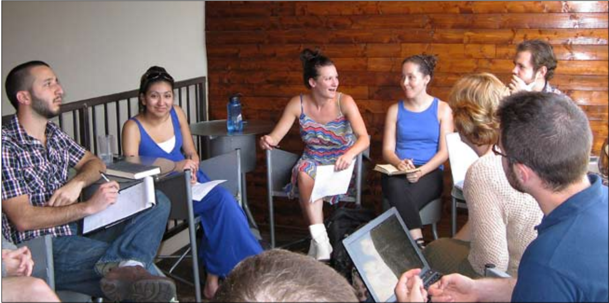
History Graduate Council meeting at Caffé Medici, a popular coffee house on Guadalupe Street, where there are also various restaurants, shops, and a Renaissance market

Our faculty includes seven Guggenheim Fellows, a MacArthur Fellow, a Pulitzer Prize winner (plus two other Pulitzer finalists). The faculty also hold numerous fellowships: Mellon, Fulbright, National Endowment for the Humanities, Institute for Advanced Studies in Princeton, and more. The History News Network has selected several of our professors as "Top Young Historians."