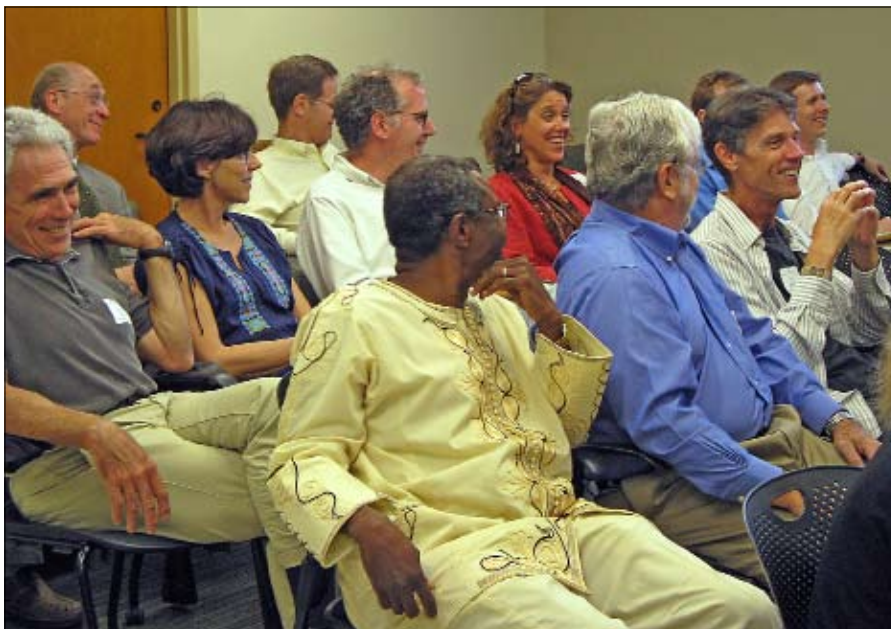
History faculty participate in Civil War Symposium hosted by the Institute for Historical Studies

Our wealth in numbers translates into qualitative benefits: graduate students explore fields in many directions with expert support. Our faculty generates a wealth of activities and opportunities that are simply unmatched by most graduate history programs.