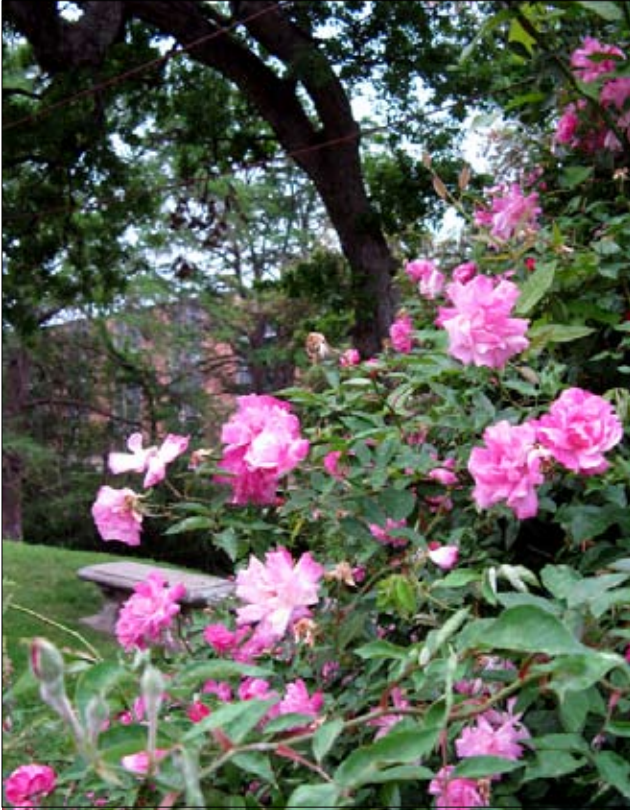
Climbing roses along Waller Creek and San Jacinto Boulevard