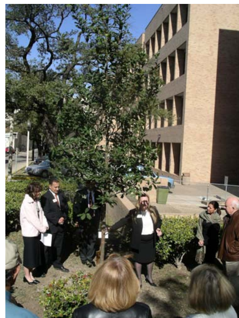
THE UNIVERSITY OF TEXAS AT AUSTIN FACILITIES SERVICES—LANDSCAPE SERVICES