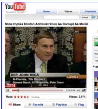
YouTube screen shot Click on image to view video

despite death threats—threats made because of his work with Americans and because of his Christian faith.