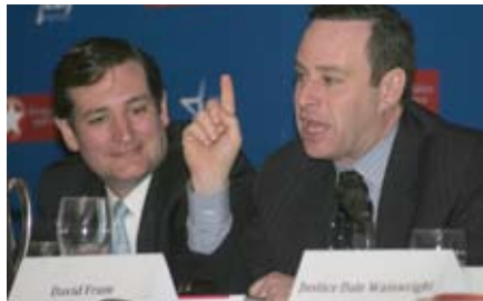
Texas Solicitor General Ted Cruz and David Frum.