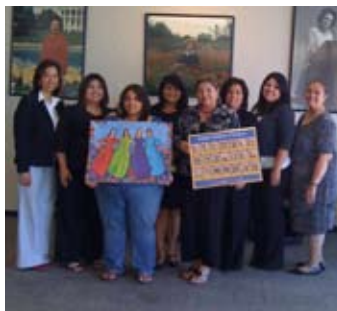
CPG partners with Las Comadres for Texas Public Policy and Campaign Training.