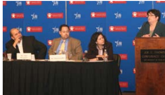
The Center hosted a panel discussion, "Understanding the Hispanic Vote in 2008."