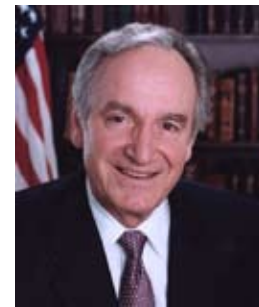
Senator Tom Harkin.