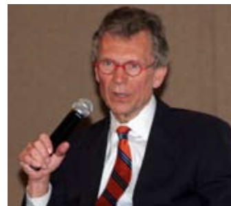
Senator Tom Daschle.