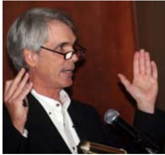
Bill Bishop, The Big Sort .