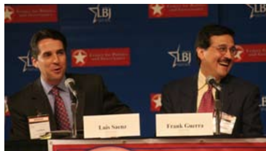
The Center launched with its inaugural conference, "The Future is Now: The Hispanic Impact on American Politics and Government."