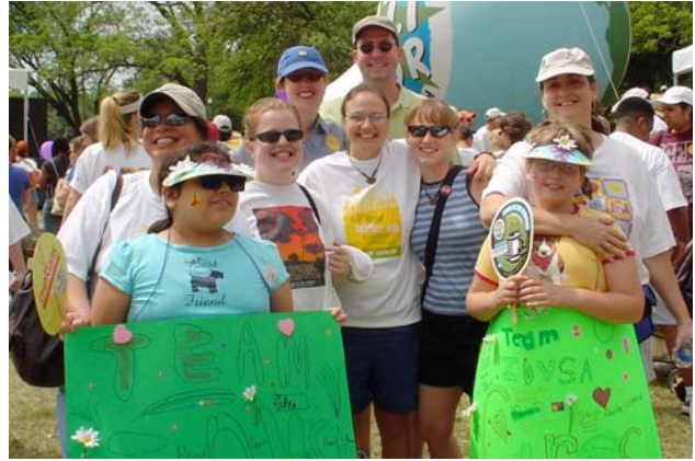
On April 16 staff and affiliates of the IDVSA joined community members for the 18 th Annual SafePlace Walk for Safe Families and Safe Streets. Team IDVSA raised over $700 and had a total of nine members that walked.

SK: We recently received funding to restart our BabySafe program which provides individual and group counseling and advocacy for victims of domestic violence who are pregnant or are new moms. We also received a contract with AISD to expand our Expect Respect program which provides individual and group counseling at school for middle- and high-school aged