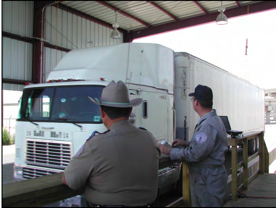
Figure 12: DPS Trooper and Inspector at the Preliminary Inspection Facility at the Bridge of the Americas

Like the other bridge crossings, if the inspectors at the preliminary inspection notice a problem with the truck, if it is suspected of being overweight, or if the truck is randomly selected for inspection, then it is sent to the secondary inspection facility (Figure 13).