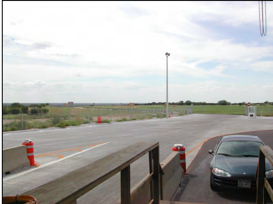
Figure 1: Entrance into the Colombia-Solidarity International Bridge DPS Safety Inspection Station

As trucks enter the inspection station, their weight is measured using a weigh-in-motion scale and the trucks come to a stop at the preliminary inspection station (Figure 1). The truck's weight is reported on a laptop computer, monitored by the inspection staff, who review the driver's cargo manifest and immigration documents (Figure 2). The inspectors also visually inspect the truck's and trailer for obvious safety violations or risks and may check the truck and trailer's turn and brake lights. If the paperwork is in order, the truck is not overweight, and it is judged to be in compliance with safety requirements during the preliminary visual inspection, the driver is typically waved through the facility and allowed to continue to the final destination within the border zone. Trucks with a CVSA sticker are typically not required to have a secondary inspection unless an inspector notices a problem during the preliminary inspection. However, if the truck is judged unsafe, is suspected of being overweight, or is randomly selected for inspection, then it will be directed to the secondary inspection facility.