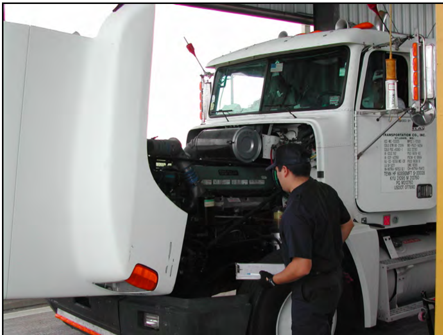
Figure 5: DPS Inspector Examining a Truck Engine during a Secondary Inspection at the Colombia-Solidarity International Bridge