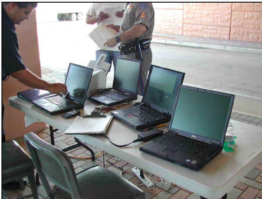
Figure 6: Temporary Computer Work Station at the World Trade Bridge Temporary Weighing Facility

Truck weights at the World Trade Bridge are initially measured using a weigh-in-motion scale that is mounted into an overpass leaving the bridge. The truck weights are reported to a computer station below. If a truck is believed to be overweight or if one of its axles has exceeded a weight limit, then flashing lights on the overpass notify the truck to exit the roadway and go to the weigh station for a more accurate weighing. Thus, after leaving the federal compound of the World Trade Bridge, the only commercial vehicles that are typically stopped by the DPS are those trucks that have been identified as having a potential weight problem by the weigh-in-motion scale. 1 The DPS has also mounted a camera on the overpass that captures an image of the overweight trucks and these images can be viewed on a laptop screen below (Figure 6). The DPS uses these images to ensure that suspected overweight trucks exit for inspection and the images can also help the DPS troopers identify trucks whose drivers have disregarded the signal to exit.