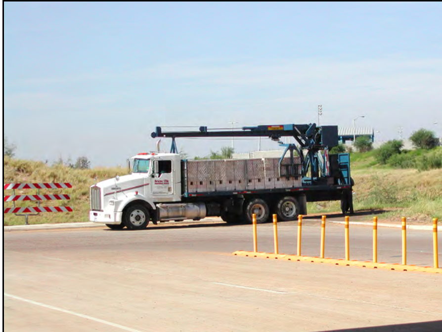
Figure 10: Overweight Truck Removed from Service and Waiting to Be Off-Loaded at the World Trade Bridge Weight Inspection Station