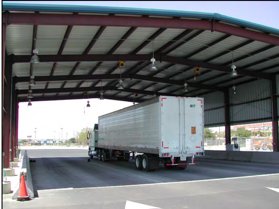
Figure 13: Truck Awaiting Inspection at the Secondary Inspection Facility at the Bridge of the Americas

Trucks that are taken out of service are sent to a parking lot within the inspection facility to await repairs (Figure 14). Depending on the nature of the repairs, the truck may stay in the out-of-service parking area for a few hours to a few days. Trucks are most frequently removed from service because their brakes need realignment, which is a relatively easy task that can usually be performed by a trained driver. Thus, if a driver is able to make the repair to the satisfaction of the DPS inspectors, then the driver is allowed to continue. In other cases, however, trucks may need tires changed or mechanical work done in which case the carrier must send a mechanic to make the repairs. If the truck is not removed within the allocated period of time, it is towed back across the border at considerable expense to the trucking company, whose trucks are not allowed to cross again until the towing fees have been paid.