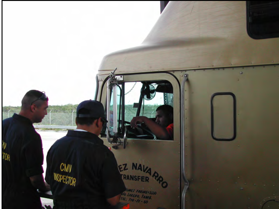
Figure 2: DPS Inspectors at the Preliminary Inspection Station at the Colombia-Solidarity International Bridge