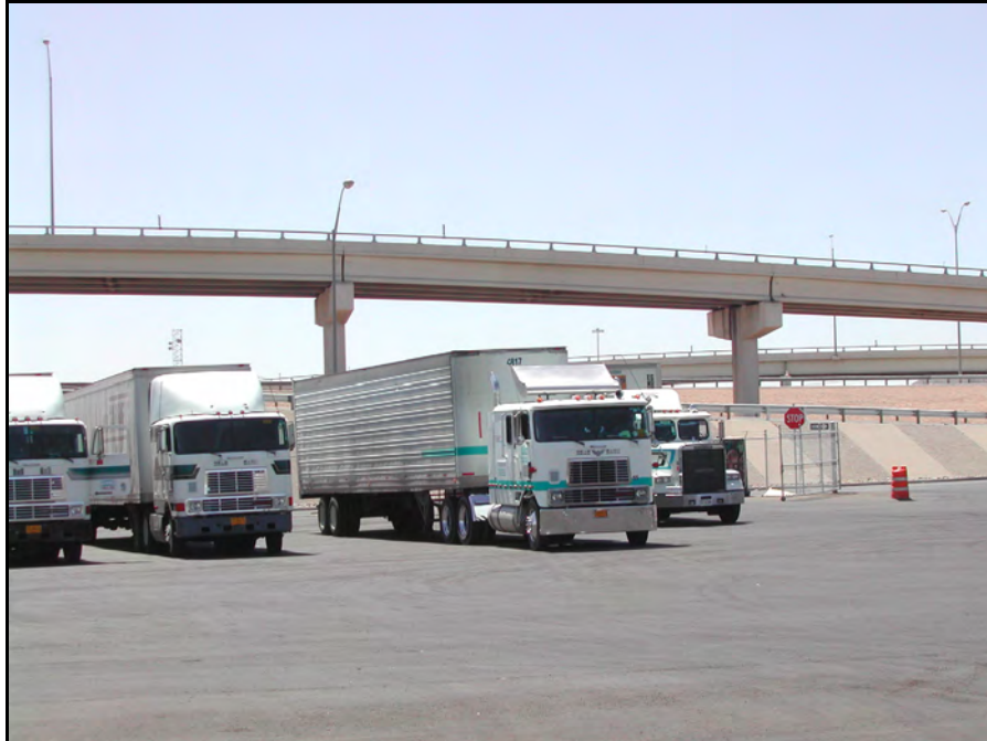
Figure 14: Trucks Removed from Service at the Bridge of the Americas