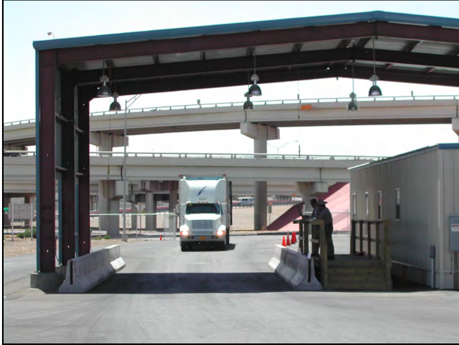
Figure 11: Truck Entering the DPS Commercial Vehicle Safety Inspection Facility at the Bridge of the Americas

Trucks pull into the covered preliminary inspection facility where the driver's paperwork is reviewed and the truck is given a visual inspection. The truck's weight from the weigh-in-motion scale is reported on a laptop computer mounted on the deck railing and is monitored by the inspectors.