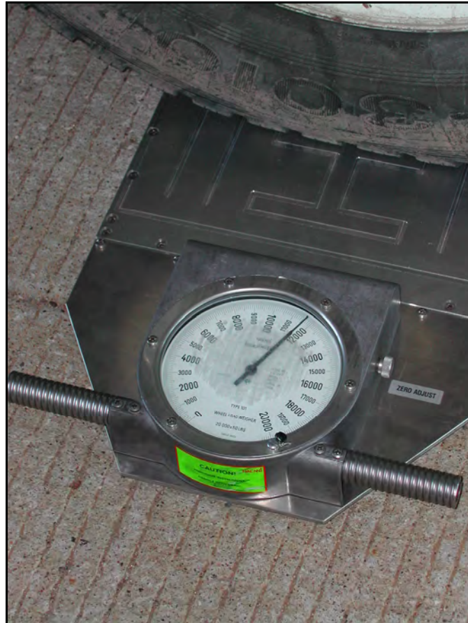
Figure 8: Close-up of a Truck Axle Being Weighed at the World Trade Bridge

Figure 8 is a close-up of the scales used by the DPS inspectors to measure the weights of commercial trucks.