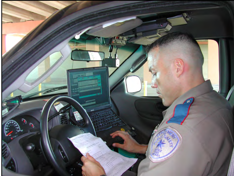
Figure 9: DPS Trooper Preparing a Citation for a Commercial Vehicle Safety Violation at the World Trade Bridge

Trucks that are placed out of service at the World Trade Bridge are parked nearby until they are off-loaded and become compliant. Figure 10 shows a small, three-axle commercial truck carrying palettes of bricks that was overloaded by several thousands pounds. DPS troopers at the station identified this driver and his company as a habitual overweight offender and, in this instance, the driver was issued a citation. Soon after this photograph was taken, another truck arrived to take part of his load so that the overweight truck would be in compliance with the law. The driver was then allowed to continue to his final destination within the border zone.