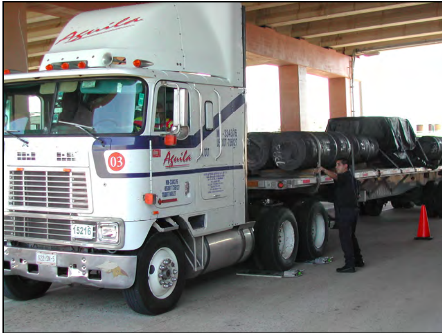
Figure 7: Suspected Overweight Truck Being Weighed at the World Trade Bridge

move the truck forward onto the scales. The axle weights are measured for each tire to determine whether any of the truck's axles are overweight or if the cargo has been stowed unevenly.