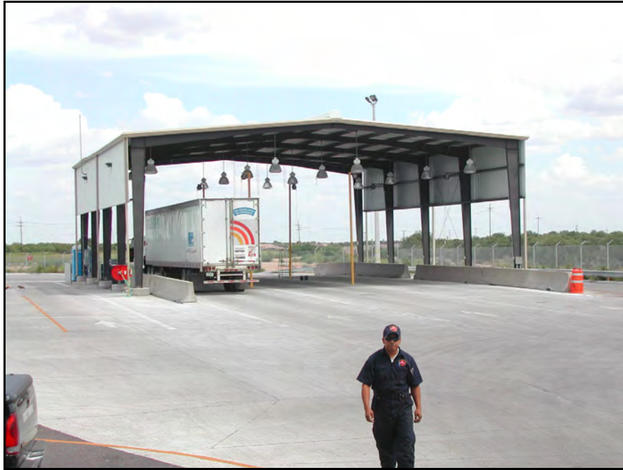
Figure 3: DPS Secondary Inspection Facility at the Colombia-Solidarity International Bridge

Drivers who are taken out of service cannot operate a commercial vehicle for 8 hours and intoxicated drivers have their driver's license and U.S. visa suspended for one year. The possession of alcohol in the cab of the vehicle also results in a 24-hour suspension of the driver, even if the container has not been opened and the driver has not been drinking. The Colombia-Solidarity International Bridge's secondary inspection facilities are shown below in Figure 3. Figures 4 and 5 show DPS inspectors conducting these secondary inspections.