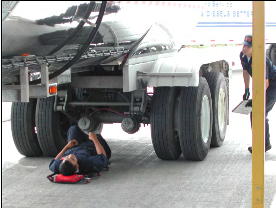
Figure 4: Inspectors Examining Truck Axle and Tires during a Secondary Inspection at the Colombia-Solidarity International Bridge