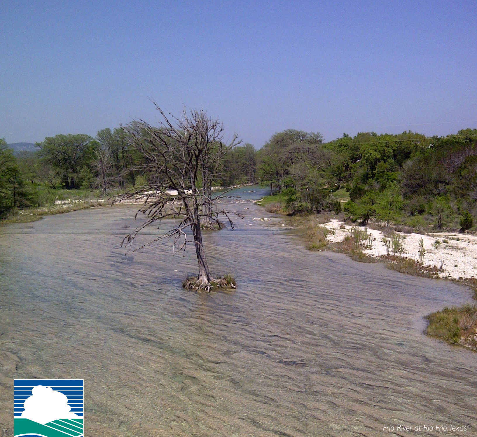
Frio River at Rio Frio, Texas

Information & Tools for Public Water Systems & Utilities